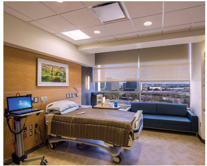
UT Southwestern.