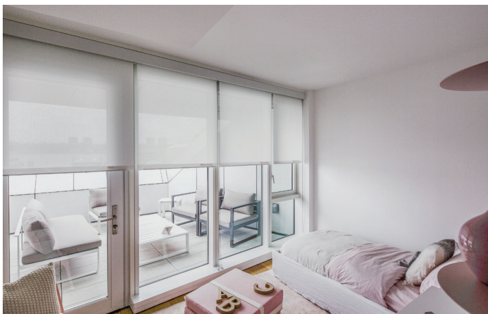
EcoVeil Sheer in VIA 57 West by BIG. Photo: Mecho