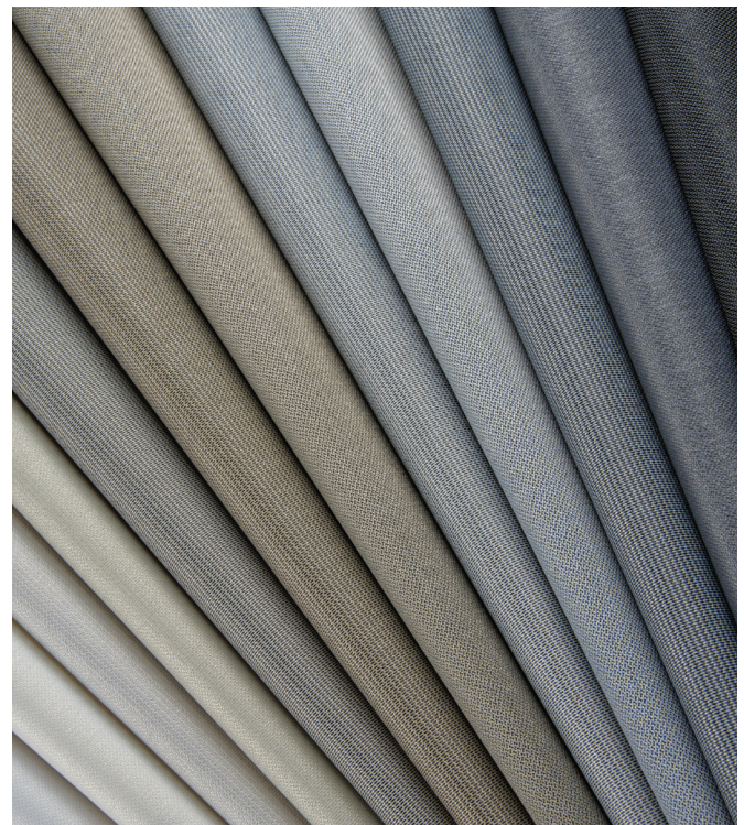
EcoVeil Sheer Collection.

Mecho is pleased that the EcoVeil Sheer™ product has been able to quickly achieve so many healthy standards including the Healthier Hospital's Safer Chemical Challenge and the C2C Material Health Certificate.