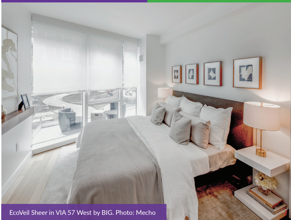
EcoVeil Sheer in VIA 57 West by BIG.

Mecho's EcoVeil Sheer is a 100% polyester shade cloth that's PVC-free and flame retardant. The EcoVeil Sheer shade cloth features individually pigmented yarns with an attractive, distinctive twill pattern making it the ideal window covering in healthcare facilities to maximize the healthy properties of natural light.