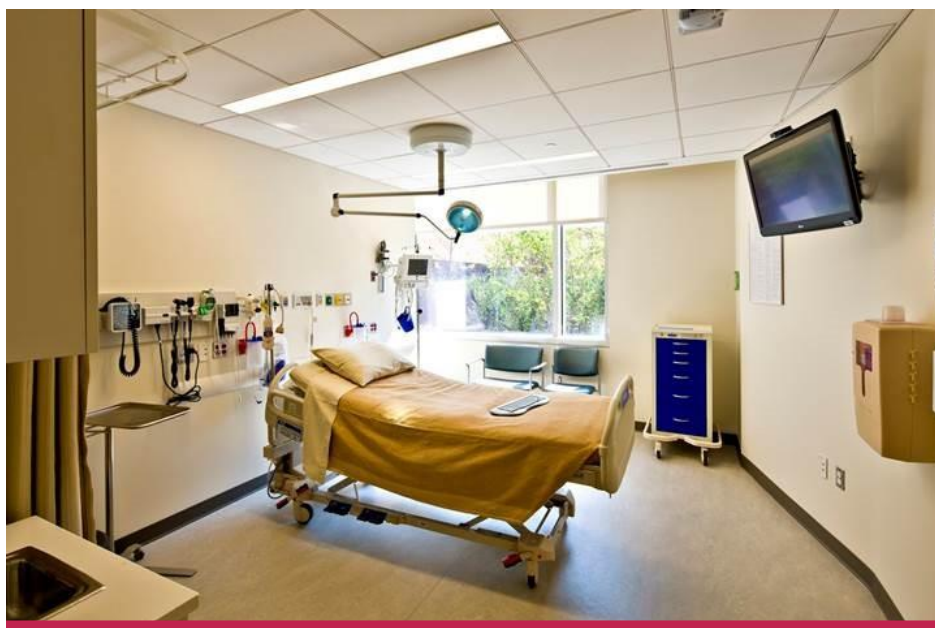
Senior Care Emergency Department Patient Room