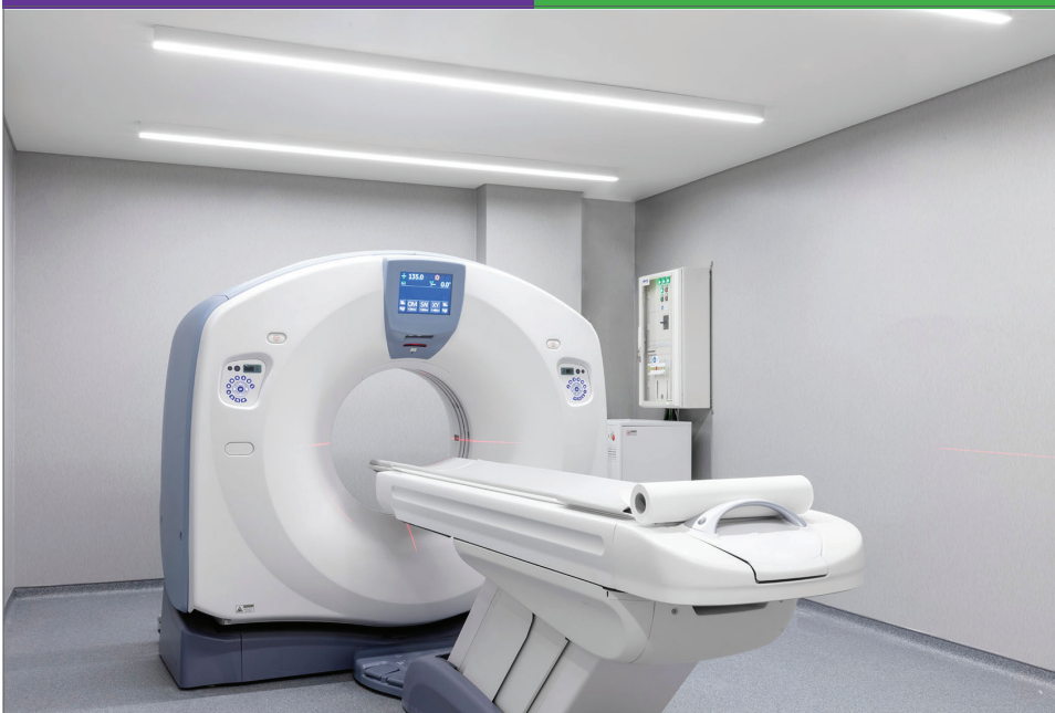
Altro Puresentials PVC-free commercial wall cladding provides an eco-friendly hygienic solution in this MRI area.

Altro Puresentials is an innovative wall cladding system that meets your commercial durability, cleanability, and hygiene needs. An ideal solution for areas that require PVC-free options. Altro Puresentials is a 2mm thick, semi-rigid plastic panel that comes in 4x8' and 4x10' sheets.