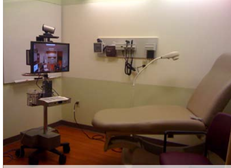
Location: Sidney R. Garfield Health Care Innovation Center in San Leandro, CA

Figure 7. Portable Telemedicine Equipment in an Exam Room