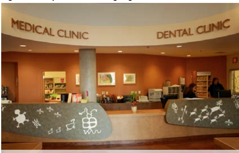
Location: Native American Health Center's Seven Directions Health Center in Oakland, CA

Figure 4. Example of a Welcoming Registration Area