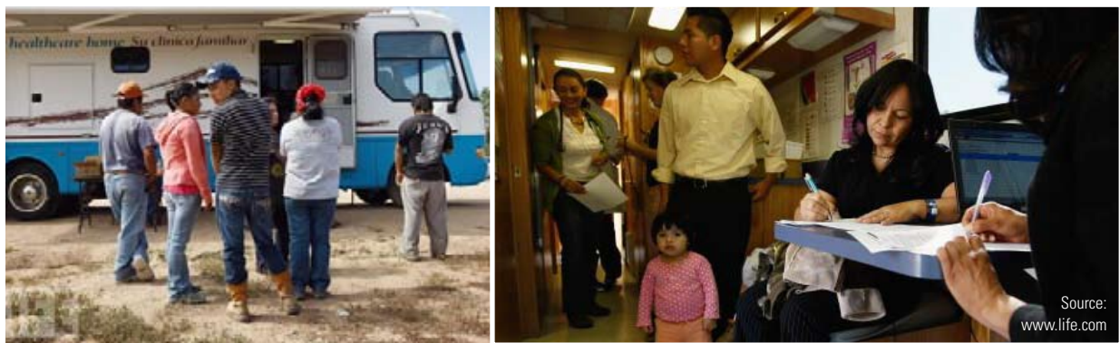
Figure 3. The Mobile Health Unit Used by Salud Family Health Centers in Colorado

The decision to purchase a mobile health vehicle should be based on detailed analysis of the needs of the targeted populations, the clinic's perception