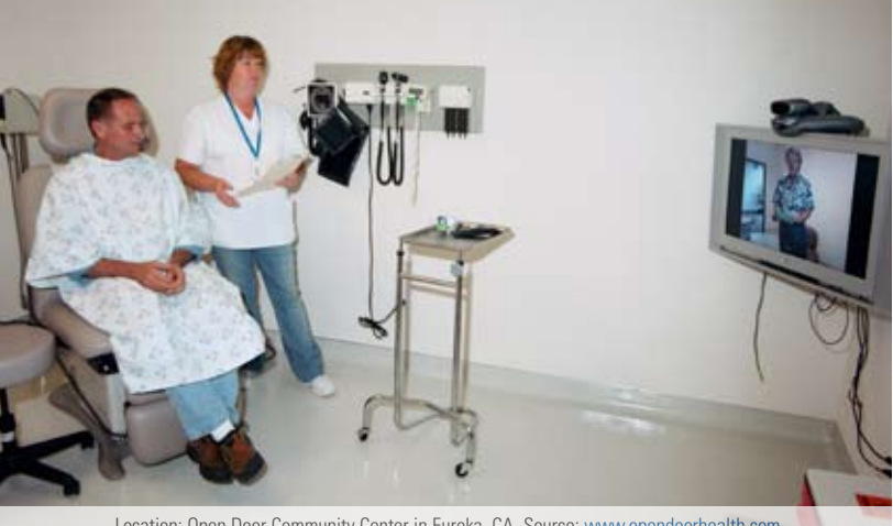
Location: Open Door Community Center in Eureka, CA.

Figure 7. Portable Telemedicine Equipment in an Exam Room