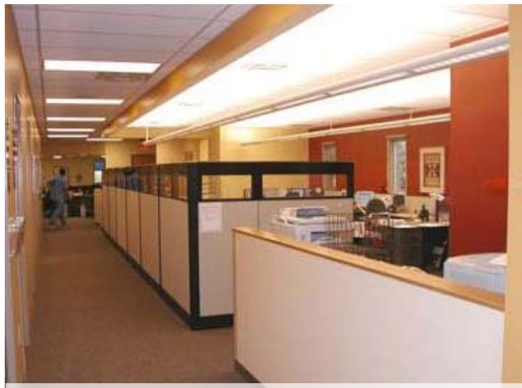
Location: Lafayette Clinic of Clinica Family Health Services in Colorado.