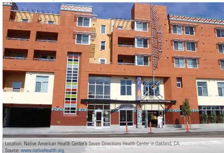
Figure 1. Example of a Mixed Use Facility

floor and reach the upper floors by elevators. The idea of co-locating health clinics with housing units was based on the community's need for high-quality health care as well as affordable housing.