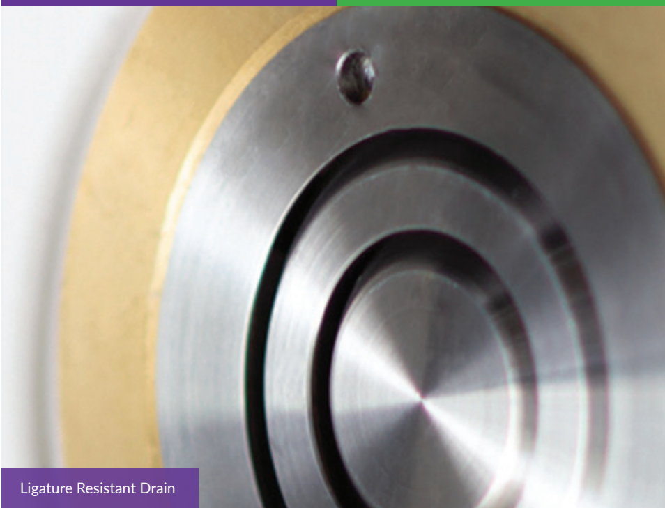
Ligature Resistant Drain

The ligature-resistant shower drain cover is designed to help lower the risks of suicide, self-harm, and the concealing of contraband, while the flush-mounted design provides a sleek, contemporary look.